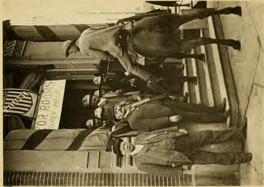
"I WANT TO SEE THE COMMITTEE AT ONCE."